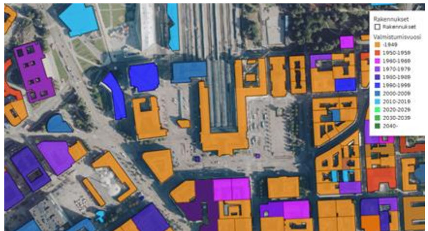
Buildings by year of construction in the Helsinki city center around railway station (SeutuAtlas)